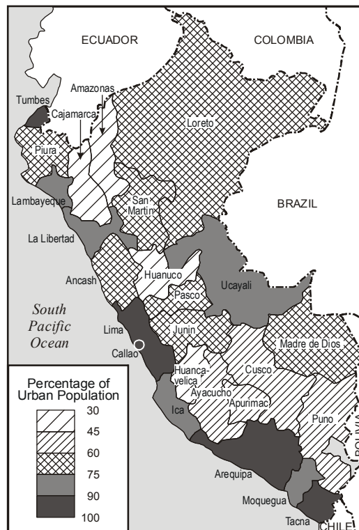
Fig. 1. Peru: urban population by administrative regions (2007)

20% resided in cities. According to the National Institute of Statistics and Informatics ( Instituto Nacional de Estadística e Informática – INEI , in Spanish), the main agency in charge of administering statistical and informatics systems in Peru, by 1940 most Peruvians were still rural dwellers (64.6%) (INEI 2008b, 2013). However, by the 1981 census these percentages were inverted: the urban population multiplied by five, increasing from 2.2 million to 11.1 million dwellers, while the rural population grew from 4 to 5.9 million (INEI 2008b, 2013, Ministerio de la Mujer y Desarrollo Social 2011). In other words, while in 1940 two out of three Peruvians lived in the countryside by 1981 two out of three lived in cities. Following this tendency, the urban population reached 70.1% in 1993 and 75.9% in 2007 (INEI 2008b, 2013, Ministerio de la Mujer y Desarrollo Social 2011). Today, more than three quarters of the census population of Peru is urban. Given that the results of the 4 th Population Census and 6 th Housing Census in Peru, conducted by INEI, provide the most recent demographic data, the present paper will refer to them when describing Peru's current social context.